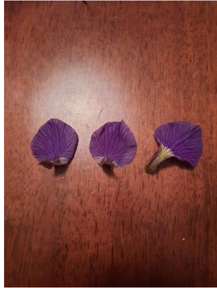
Three outer petals