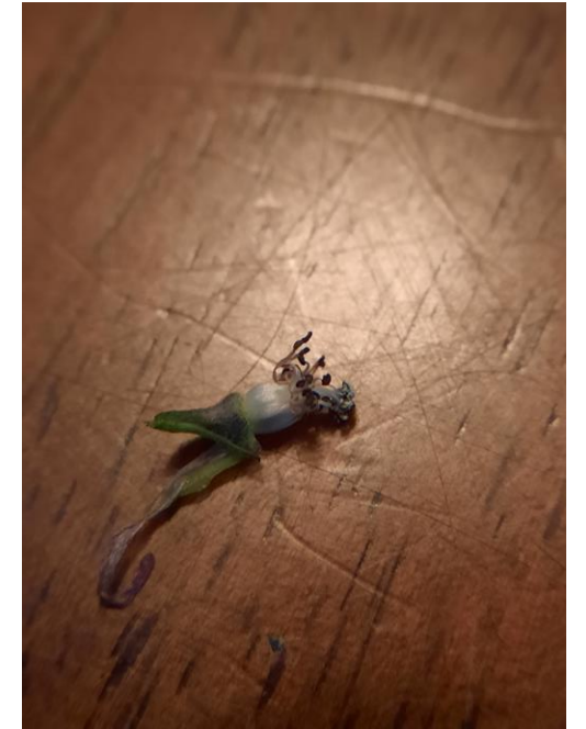
Reproductive organs hidden behind petals