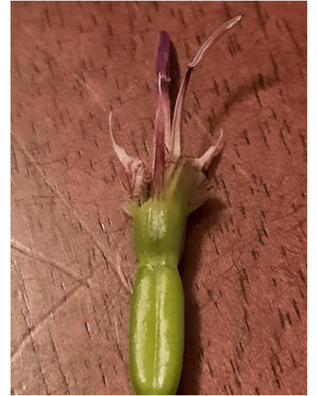
All petals removed, inferior ovary