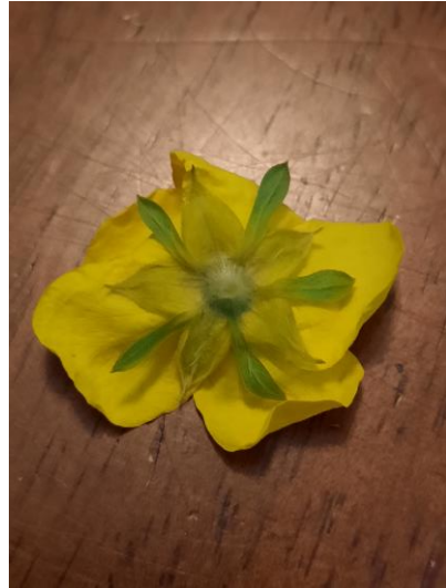
Two sets of five sepals