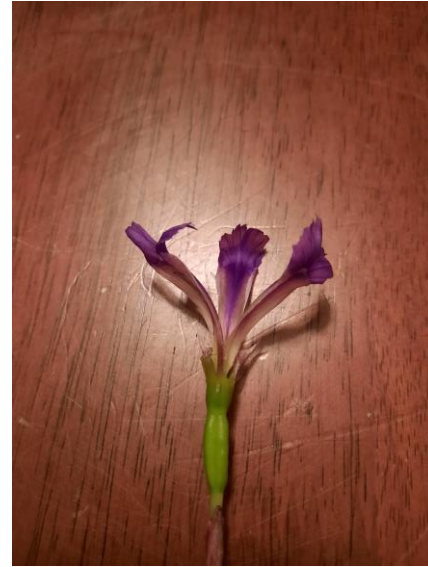
Three inner petals