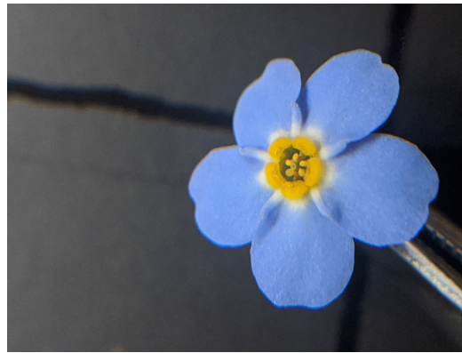
radially symmetrical flowers