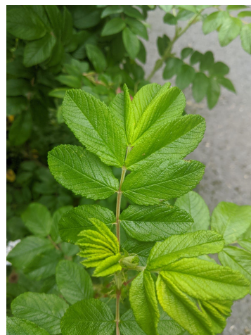
oddly pinnately compound leaf