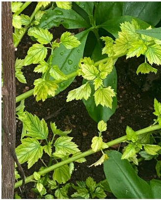
Opposite Leaf Attachment