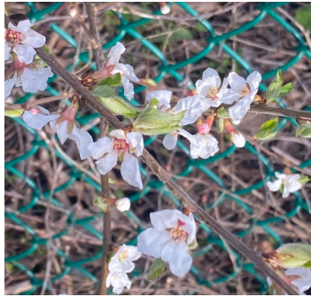
Free Central Placentration